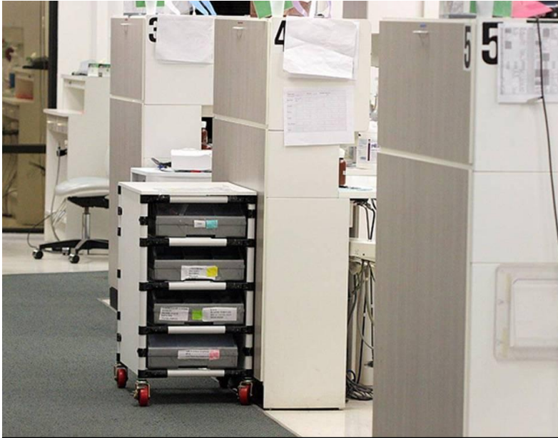
Staff members use a cart with dental supplies to replenish supermarket materials used daily.

Bahri replaced the boxes of inventory in the cubicles with “little supermarkets ,” small racks of plastic trays holding small quantities of virtually every material needed for any procedure. “We put a little bit of everything in the cubicles so I can go from one procedure to another,” he noted. At first, dentists or hygienists wrote on sticky notes what materials needed to be replenished. They stuck the notes to the supermarket trays holding the particular material in short supply. At the end of the day, a part-time employee wheeled a cart stocked with materials from cubicle to cubicle,