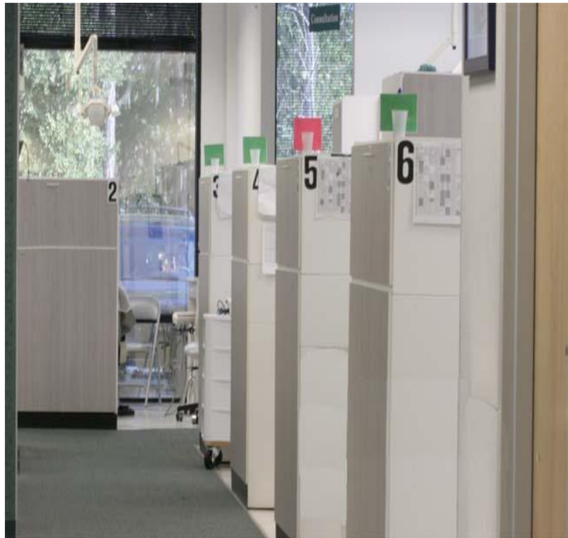
The red card atop cubicle 5 signals the flow manager that help is needed to stay on schedule.

A patient seated in the waiting room is a sign there is a problem. “If a patient is waiting to be seated, I’d pick up on that right away,” said Marisa Young, the office’s other flow manager. “I’d go and investigate to find out what’s going on. Maybe a room needs to be cleaned or instruments sterilized. Every minute the patient should have something valuable